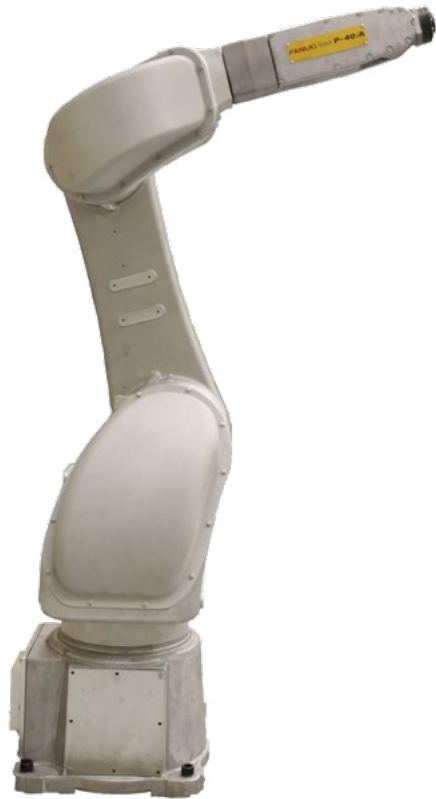
P-40iA Paint robot